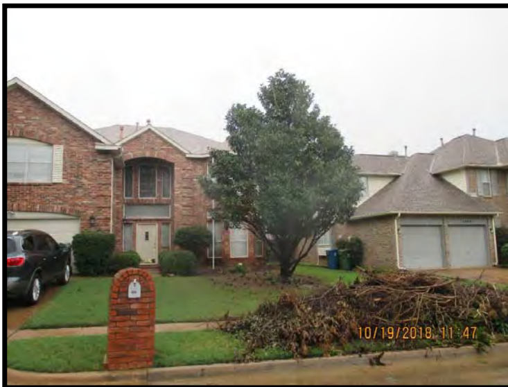
Limbs Too Long and Not Bundled